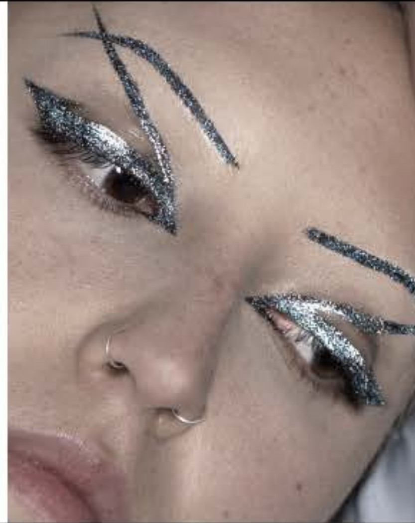
Shade Obsidian 4.10 Δ