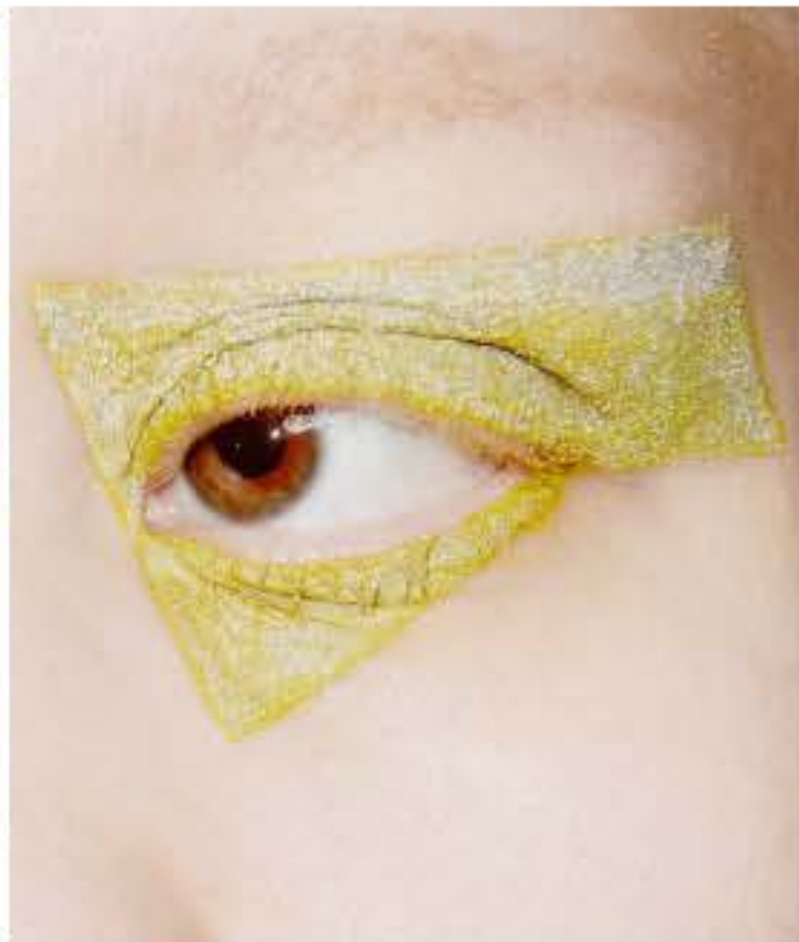
Shade Beudanite 8.84 Δ